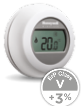
Y87 Digital Room Thermostat