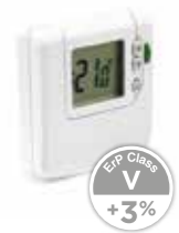
DT92 Digital Room Thermostat